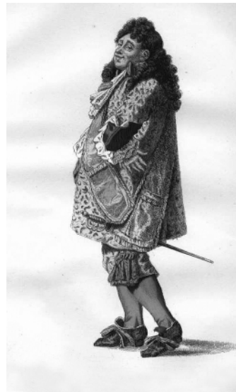
Le Bourgeois Gentilhomme

Today, while the kind of self-consciously reactionary argument made by Sombart is rare in much of the world, hostility to trade as demeaning and lacking in moral grandeur is common. The kind of arguments analyzed by Buruma and Margalit have now appeared prominently in the form of Islamism. Generally speaking, in popular culture the businessman is as disreputable as ever. One important reason for this is the changing perspective of artists. Between the early seventeenth and mid-nineteenth centuries many artists and writers were supporters of mercantile values against those of the aristocracy and clergy. In the later nineteenth century, however, many came to associate the life of the bourgeois with stultifying conformity, hypocrisy, and philistinism. The works of authors such as Ibsen and Flaubert are classic examples. There is no essential reason, however, why this should be so, and it reflects the particular features of late-nineteenth-century society. To reconcile the bourgeois and the artist is one of the tasks of our time.