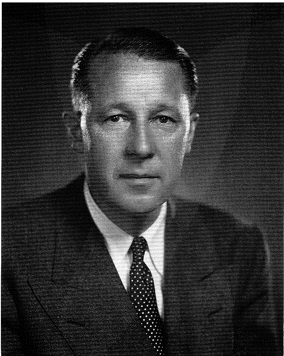
Leonard E. Read