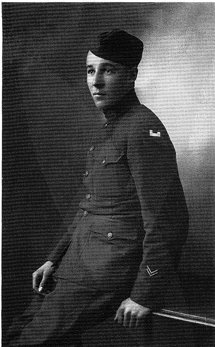
Leonard Read served proudly with the 158th Aero Squadron, U.S. Army, 1917-1919. He was a skilled and exacting aircraft mechanic who recounted that no flyer ever lost his life because of structural failure of the plane he had rigged.