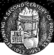
TAPPING THE NEW OPEN HEARTH'S AT J&L'S PITTSBURGH WORKS. The molten steel flowing into two giant-size ladles symbolizes J&L's capacity for modern, scientific methods of mass-producing steel.