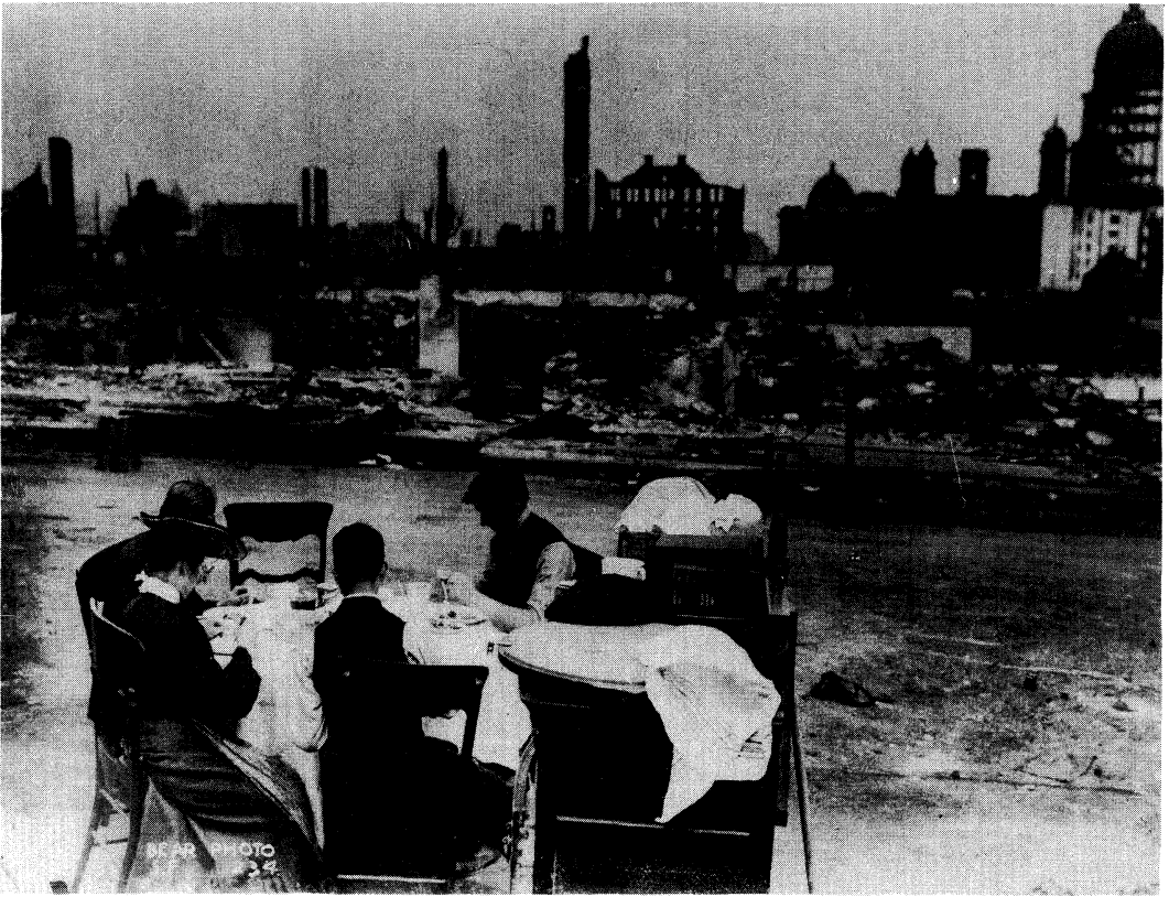
Refugees eating on Franklin Street, near Fulton Street, after the San Francisco earthquake, 1906.